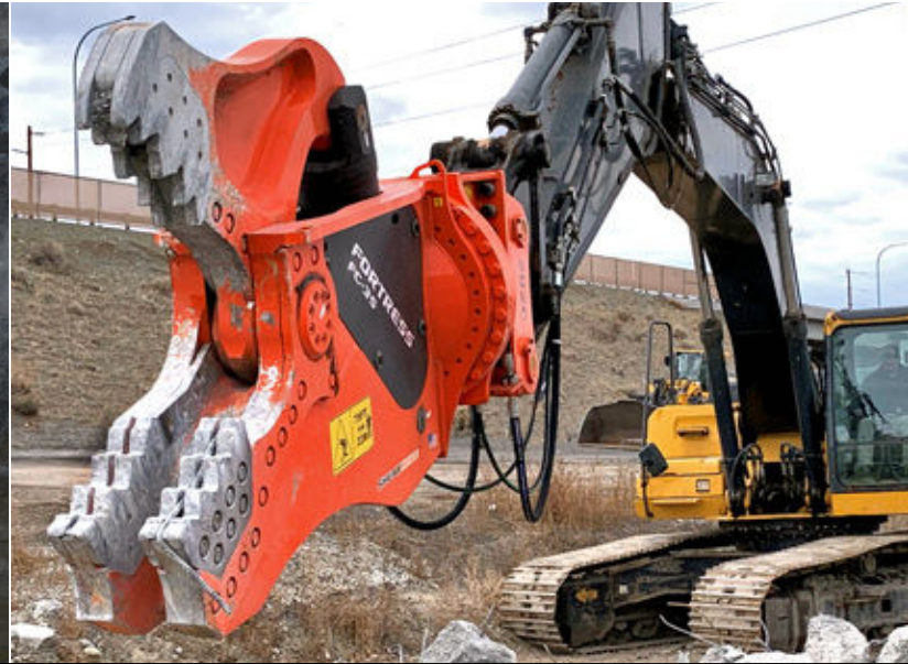
Unmatched Power to Weight