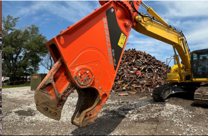
Unmatched Power to Weight

More power requires more strength and rigidity. Our unique manufacturing capabilities allow us to utilize 6" high-yield plate and use fewer overall components.